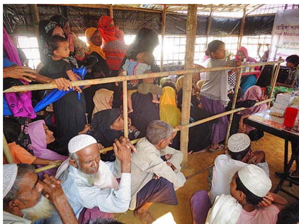
Patients in medical camp